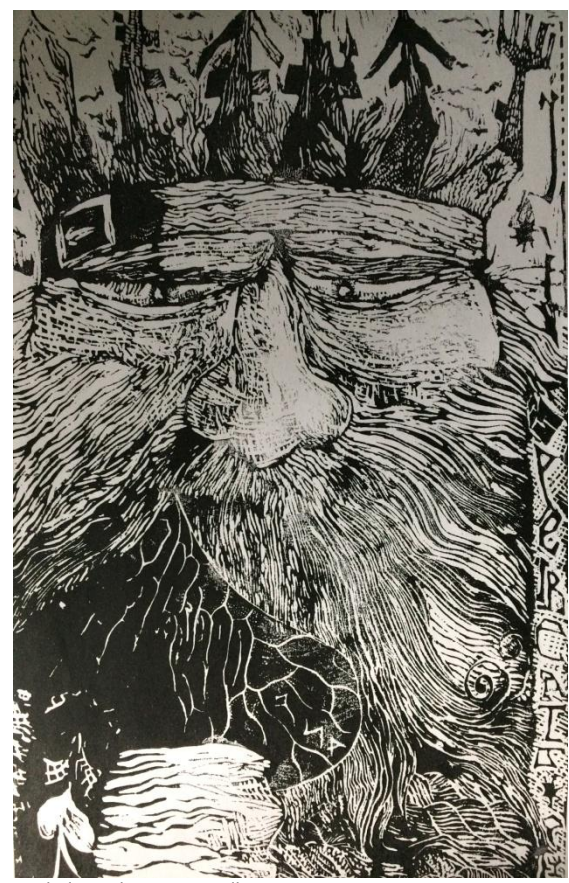
Mythological Figure: Giselbertus

We have peered with your eyes Through a crack in time We have glimpsed the Gorgon's head. Through you we bear witness. The wise ruminate in a void, Spout drolleries in temples of air, As the lords of death Hover in the wings, Waiting??