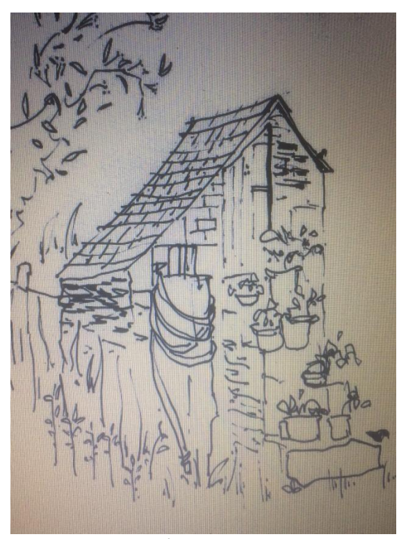
Outhouse: Brigid O'Brien

It can be difficult at times. Knowing you are so normal And being attacked for such a small thing. It's only sexuality. I want to be friends, I feel no hate. But you get at me, I have to get at you. I'm not classy enough to be the bigger person. And why should I be? We may seem like an easy target For many other sexualities. But we're tough. We have to be. We're "the new kids on the block", As you say. Go on with your power play Because no one puts Baby in the corner.